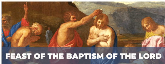
FEAST OF THE BAPTISM OF THE LORD